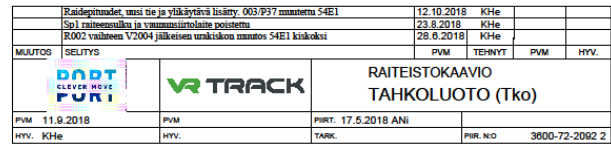
Railway diagram: Tahkoluoto